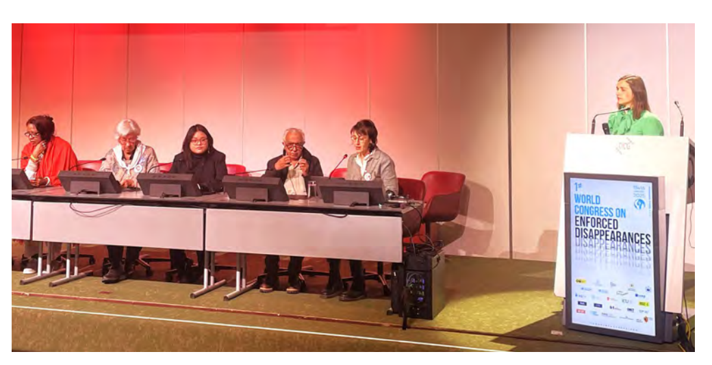
The first World Congress on Enforced Disappearances concluded with a call to collective action during an engaging closing ceremony. In line with its multi-actor, action-oriented approach, a series of concrete follow-up initiatives were unveiled to carry forward the initiative.

Representatives of each region – Africa, Asia, Europe, MENA and Latin America–presented priority actions identified as an outcome of the workshop on regional roadmaps.